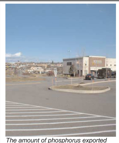
The amount of phosphorus exported from a project site will depend on the land use and soil type, with greatest exports from impervious surfaces as the one shown here.

Use the first four columns in Worksheet 2 in Appendix D to calculate the Pre-PPE.