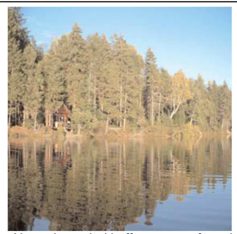
Natural wooded buffers are preferred over other BMPs due to their low maintenance.

Best Management Practices (BMPs) must be designed to meet the required phosphorus reductions based on the Project Phosphorus Budget (PPB). The lowest maintenance BMP that meets the PPB should be selected.