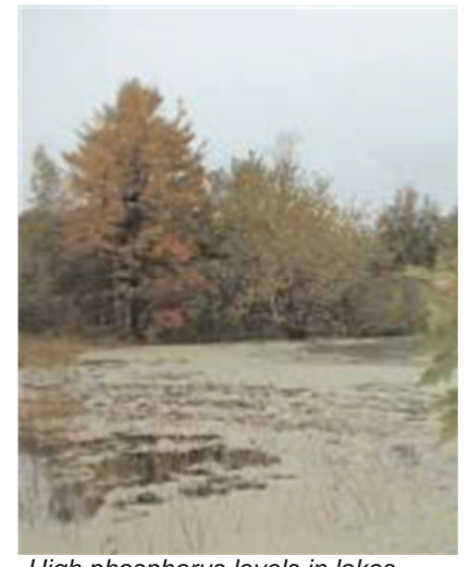
High phosphorus levels in lakes cause dense algae blooms, which can accumulate along the shoreline as shown above.

• Depleted oxygen levels in the deep, cold water which can lead to fish kills