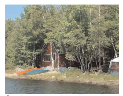
Smaller residential development projects can use alternative performance standards to meet their phosphorus control obligations. These generally involve restrictions on disturbance, buffers and impervious area or the incorporation of Low Impact Development (LID) techniques.

Alternative performance standards may be used for certain smaller, residential projects. These generally include specific development restrictions and the use of Low Impact Development (LID) practices.